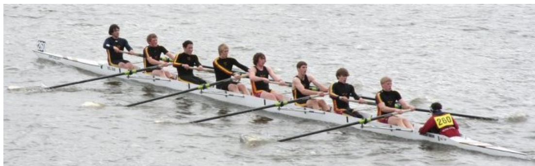
M1 at Head of River Race 2010