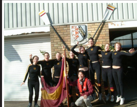
The second Ladies win their Blades, Lent Bumps 2007.

On the mens' side of the club the momentum of Lents 2006 – the second eight going up three places and the third eight winning their blades – continued through to the Mays.